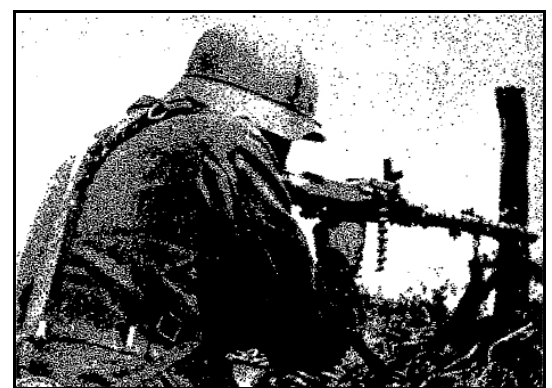
VICTORY CONDITIONS: To win, the German player must exit 7 squads (an AFV counts as 2 squads) off the west edge of board "2" via hexes 2Z10 thru 2P10 by the end of the game. The American player wins by avoiding the German victory condition.

THE ARDENNES, December 21, 1944: The key to the German Ardennes offensive lay with a quick breakthrough and deep penetration. In the north the success of a breakthrough rested heavily with Colonel Peiper's Kampfgruppe from the 1st SS Division. But the quick victories which had taken Peiper's Kampfgruppe so close to the Meuse bridges also left it in a position of danger. The Kampfgruppe had outraced most of its follow up units and had almost completely run out of fuel. The back door to Peiper had not been kept open. On the morning of the 21st, Mohnke, the commander of the 1st SS Panzer Division, collected the remaining assault elements and launched an attack in an effort to reach Peiper's Kampfgruppe. The main German effort came at a point south of Trois Ponts on the Salm River. There a company of the 505th Parachute Regiment had set up a small bridgehead on the cliffs across the river.