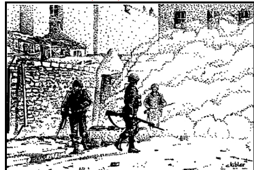
VICTORY CONDITIONS: For the US player to win, there must be no unbroken German multi-man counters in any hex of Building 1G6. The German player wins by avoiding the US victory conditions.